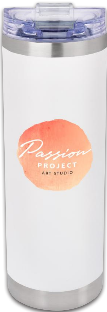
SL164PR 16 oz Urban Peak® Keystone Trail Vacuum Tumbler