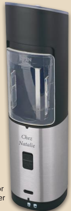
HW56 Rechargeable Salt or Pepper Spice Grinder