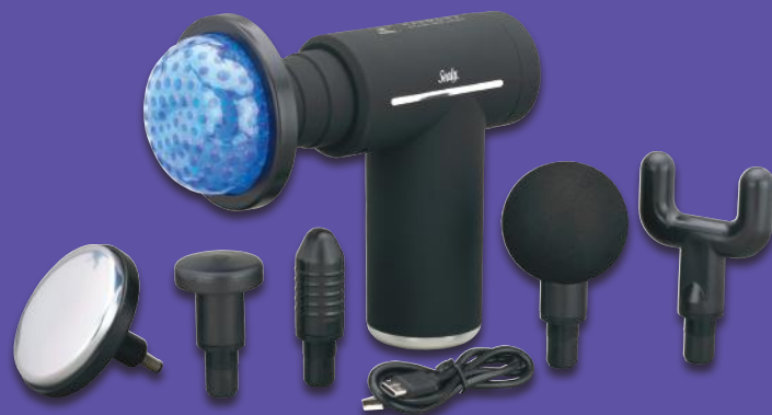
EBY10 Sealy® Hot/Cold Massager Pro

One of the many downfalls of fitness resolutions is a lack of celebrating milestones. Since healthy employees are shown to provide benefits to the employer, why not return the favor with wellness incentive gifts? These high-end favorites are sure to generate a lot of buzz around the office!