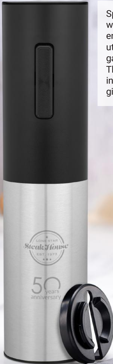
WN45 Rechargeable Cordless Corkscrew

A bottle of wine or a dinner out on the town are great incentive gifts, but they are over quickly, and there isn't a lasting reminder of the event. Giving quality items for cooking and entertaining allows for repeated reminders of a success.