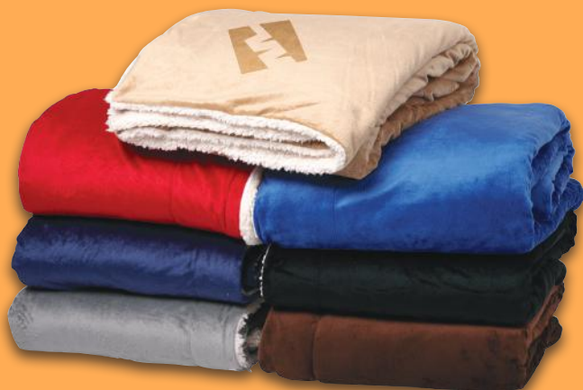
PBF57 Oversize Micro-mink Sherpa Blanket

A wireless charger is good, but a wireless charger plus a deluxe weather station is even better! Wake up ready to dress for the day's weather or keep an eye on changing conditions throughout the day.