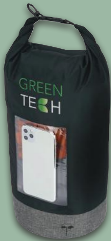
BG380 EarthTrendz™ Waterproof 10L Window Dry Bag

In a previous life, the plastic bottles used in these dry bags were designed to keep liquid inside. Now repurposed as two-tone Polyester in the new EarthTrendz waterproof dry bags, their job is to keep liquid out! The clear front pocket is water resistant and provides easy touch-screen accessibility for electronic devices.