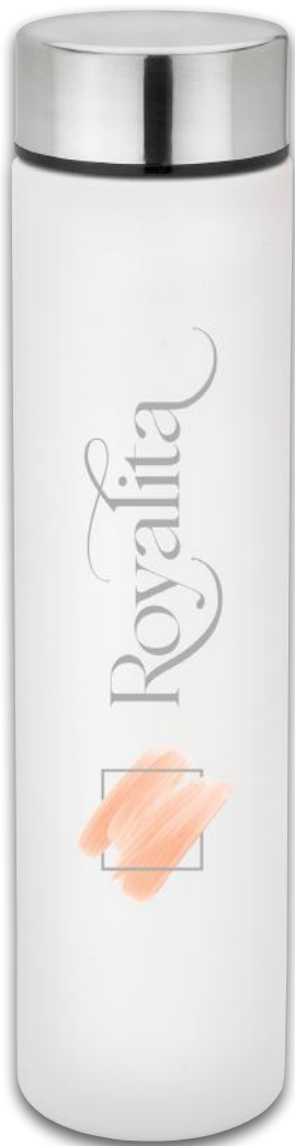
SL257PR 13.5 oz Pace Trail Vacuum Water Bottle