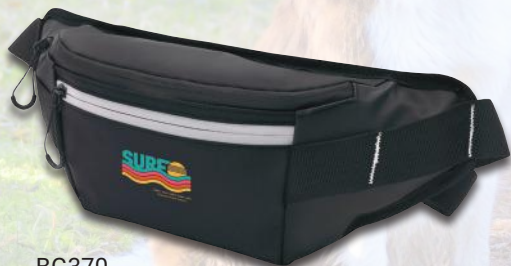
BG370 Urban Peak® Crossbody Belt Bag /Fanny Pack

A new survey from Forbes Health found that the top resolutions for 2024 include improving fitness. Even the most well-intentioned goals in January can benefit from some outside motivation to keep the momentum strong. In addition to achieving personal goals, research has shown that prioritizing employee wellness leads to companies having lower healthcare costs, reduced absenteeism, and increased retention rates.