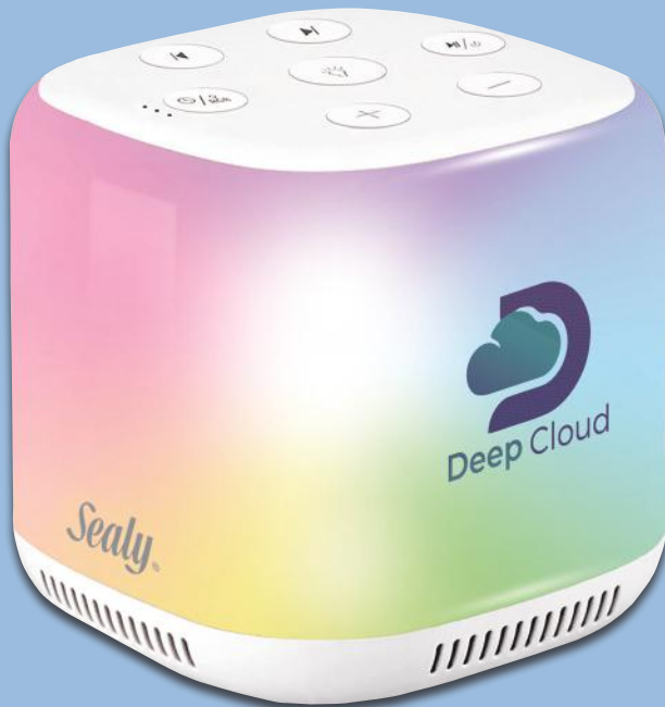
EBY15 Sealy® Night Light & White Noise Sound Machine

According to the National Institute of Health, sleep is as important for good health as diet and exercise. Plus, good sleep improves your brain performance and mood. Not getting enough quality sleep regularly raises the risk of many diseases and disorders. These range from heart disease and stroke to obesity and dementia. Associate your brand with putting clients' well-being first by co-branding a soothing gift.