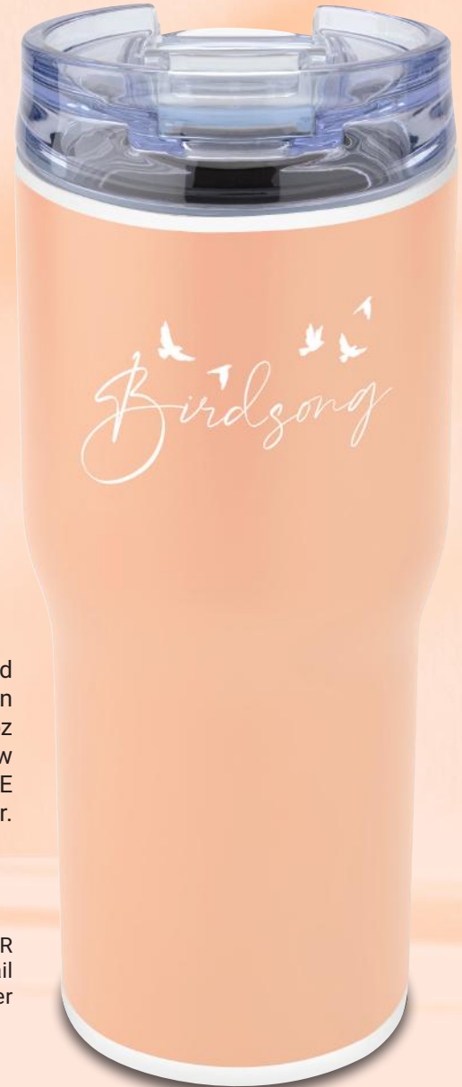
SL234PR 20 oz Urban Peak® Trail Vacuum Tumbler

Our new TRU.0 decoration method allows for full coverage print on our best-selling Urban Peak 20oz Tumbler. During Q1, this new decoration method is available FREE on the 20oz SL234PR tumbler.