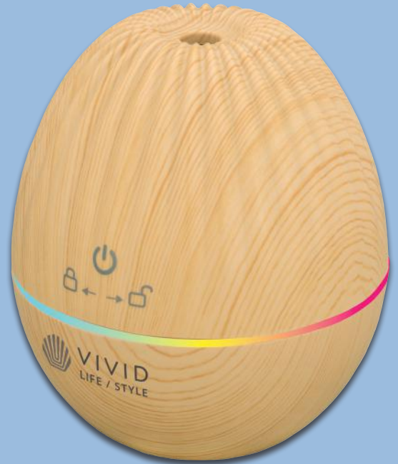
EBY21 Sealy® Color Changing LED Humidifier

Humidifier therapy adds moisture to the air to prevent dryness that can cause irritation in many parts of the body. They can also ease some of the symptoms caused by the flu or common cold.