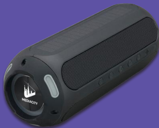
EL209 Urban Peak® 20W TWS Party Barrel wireless speaker