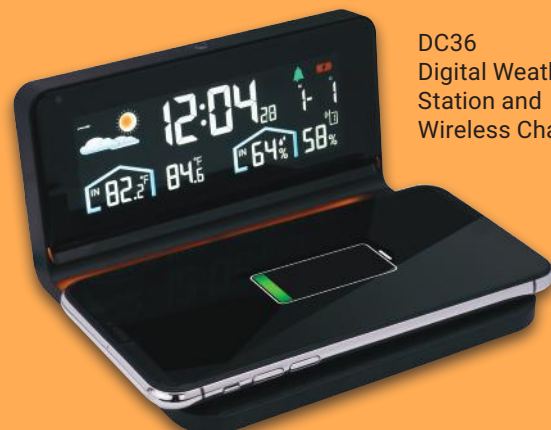
DC36 Digital Weather Station and Wireless Charger

A wireless charger is good, but a wireless charger plus a deluxe weather station is even better! Wake up ready to dress for the day's weather or keep an eye on changing conditions throughout the day.