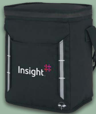
CB183 EarthTrendz™ rPET Zephyr 12 Can Cooler

In a previous life, the plastic bottles used in these dry bags were designed to keep liquid inside. Now repurposed as two-tone Polyester in the new EarthTrendz waterproof dry bags, their job is to keep liquid out! The clear front pocket is water resistant and provides easy touch-screen accessibility for electronic devices.