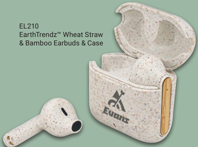
EL210 EarthTrendz™ Wheat Straw & Bamboo Earbuds & Case