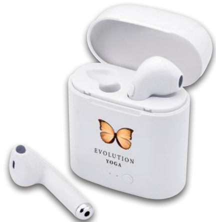
EL 176 Atune Bluetooth® Earbuds with Charger Case

Whether you're looking for a full-coverage decoration or just a splash of peach color – these styles offer our award-winning TruColor imprint with FREE PMS matching to ensure Peach Fuzz 13-1023 is exactly correct!