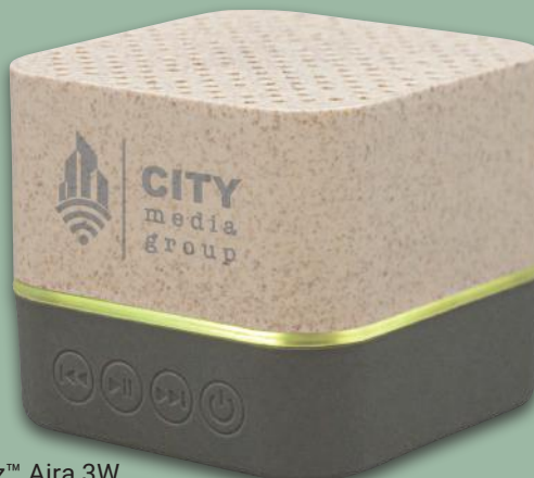
EL213 EarthTrendz™ Aira 3W Bluetooth® Speaker

When wheat is harvested, it leaves behind a by-product called wheat straw that would normally be discarded. These new electronic items from EarthTrendz utilize a new bioplastic derived from wheat straw as part of their construction. Not only is there a reduction of non-recycled materials, but it creates a lighter-weight final product.