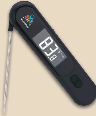
HW57 Infrared Cooking Thermometer

One of the perks of gifting products for home entertainment is that the function of the piece doesn't need to be complex, but the design and materials can be elegant and expensive. This allows you to capture a wider audience with the same gift, which will be appreciated for its sophistication by even the most accomplished of culinary experts, while remaining inviting and accessible to chefs of all levels.