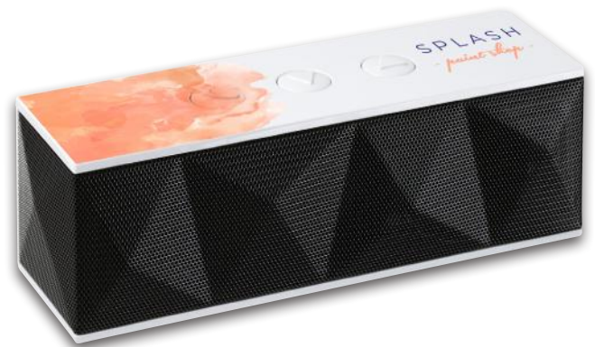
EL73 RoxBox™ Duet Bluetooth® Speaker