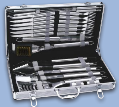
BBQ4 24 Piece Deluxe BBQ Set