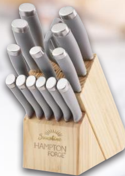
LHF02 Hampton Forge® Epicure 15 Piece Cutlery Block Set