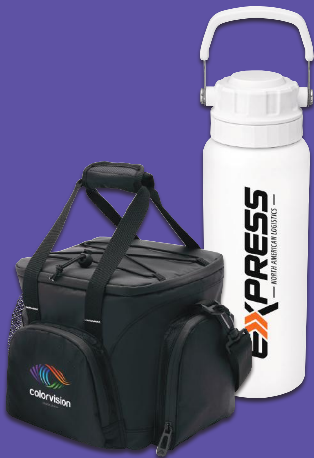
CB176 Urban Peak® Waterproof Roxhill 12 Can Cooler

Water bottles can also be personalized with the employee's name at no additional charge by selecting laser engraving or TruColor decoration.