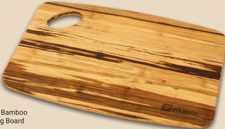
KS64 Grove Bamboo Cutting Board

One of the perks of gifting products for home entertainment is that the function of the piece doesn't need to be complex, but the design and materials can be elegant and expensive. This allows you to capture a wider audience with the same gift, which will be appreciated for its sophistication by even the most accomplished of culinary experts, while remaining inviting and accessible to chefs of all levels.