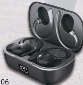
IH06 iHome® XT-82 True Wireless Earbuds & Charger Case

Building a health habit requires the activity to become a seamless part of the recipient's routine. One way to assist in this goal is to provide a belt-bag for essentials to facilitate a quick exit out the door. Another is with a pair of quality, sweat-proof earbuds to harness the power of music as a movement motivator.