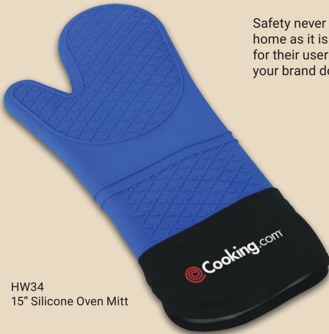
HW34 15" Silicone Oven Mitt

Safety never takes a vacation! Focus on safety is as important in your home as it is in the workplace. Not only do safety-themed gifts look out for their users' well-being, but they also send a strong message that your brand does the same.