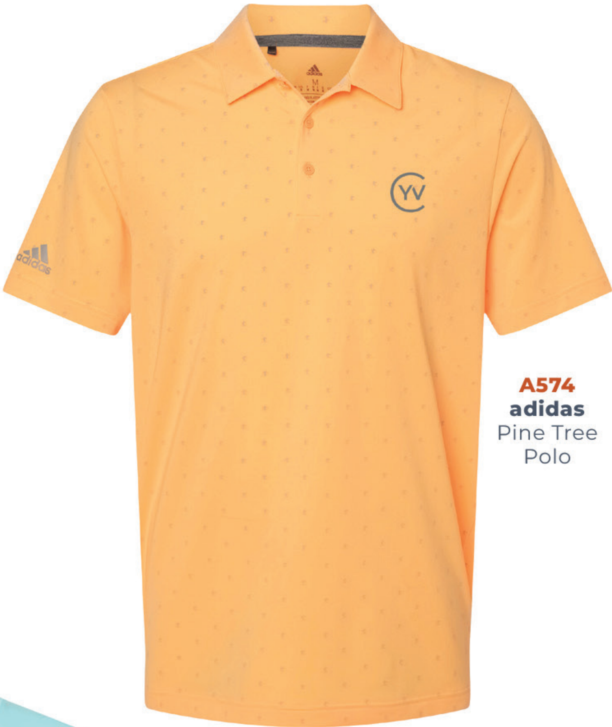
A574 adidas Pine Tree Polo

Golf is more than a sport. It’s a lifestyle. A few hours spent outdoors with friends, coworkers or clients having fun calls for a branding opportunity that lives beyond the golf course.