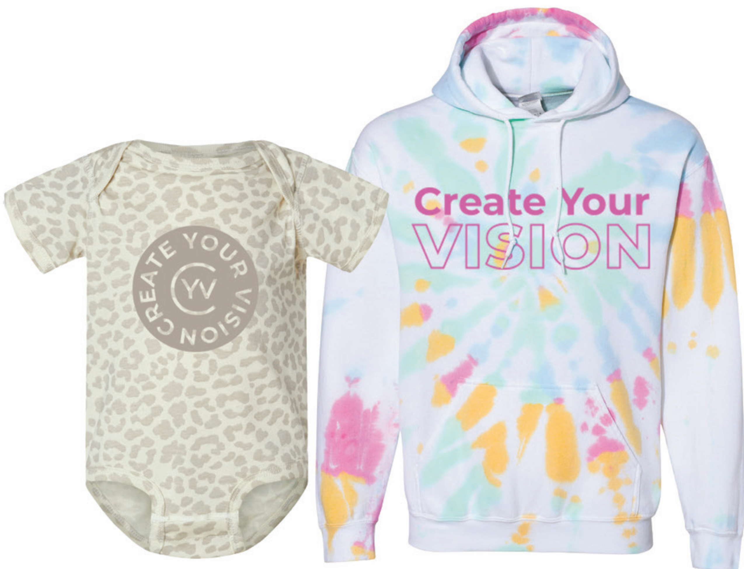
4424 Rabbit Skins Infant Fine Jersey Bodysuit

You don't have to do something extravagant to help save the earth. Something as simple as buying sustainable products can reduce your carbon footprint.