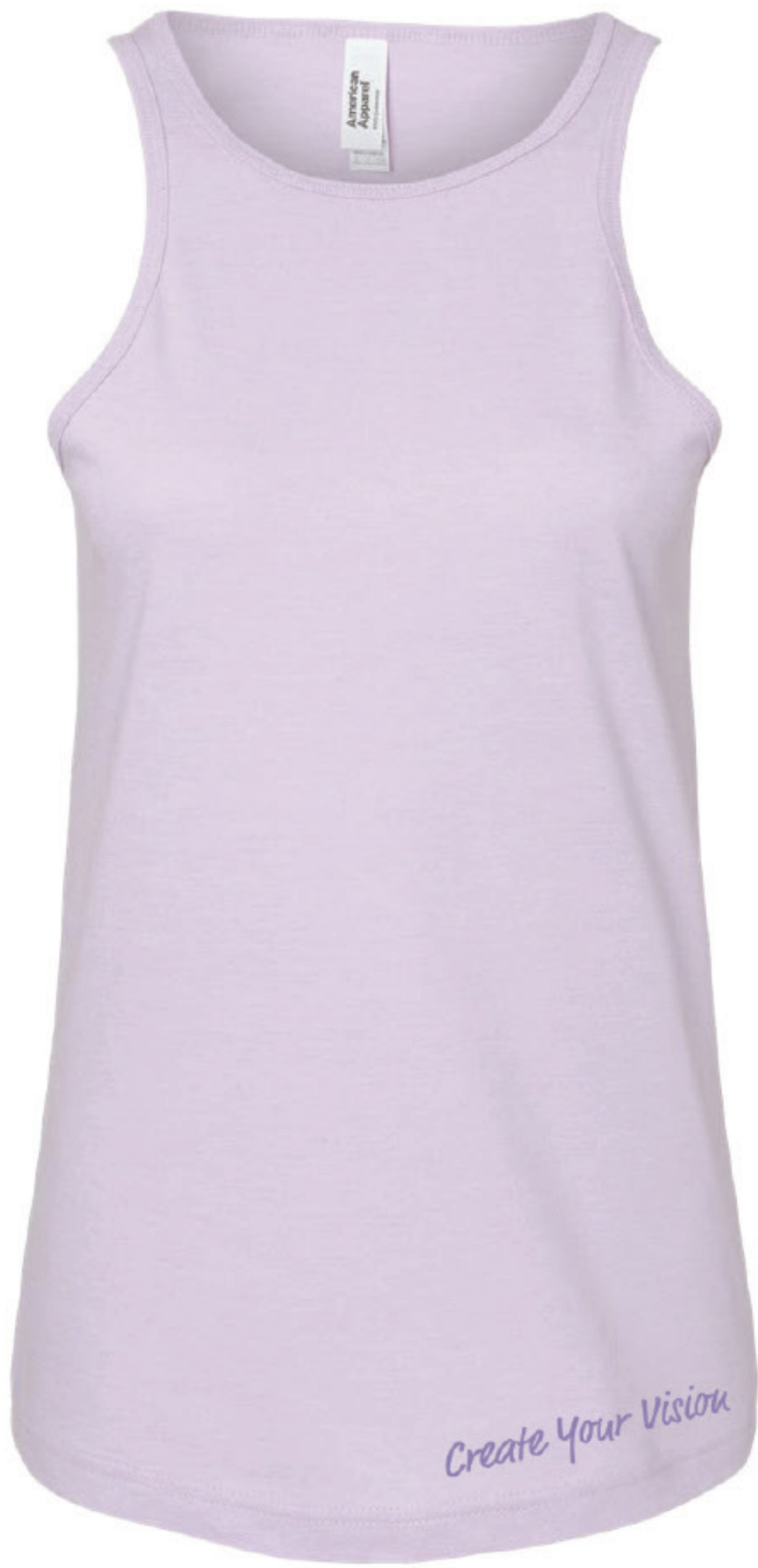
101CVC American Apparel Women's CVC Tank