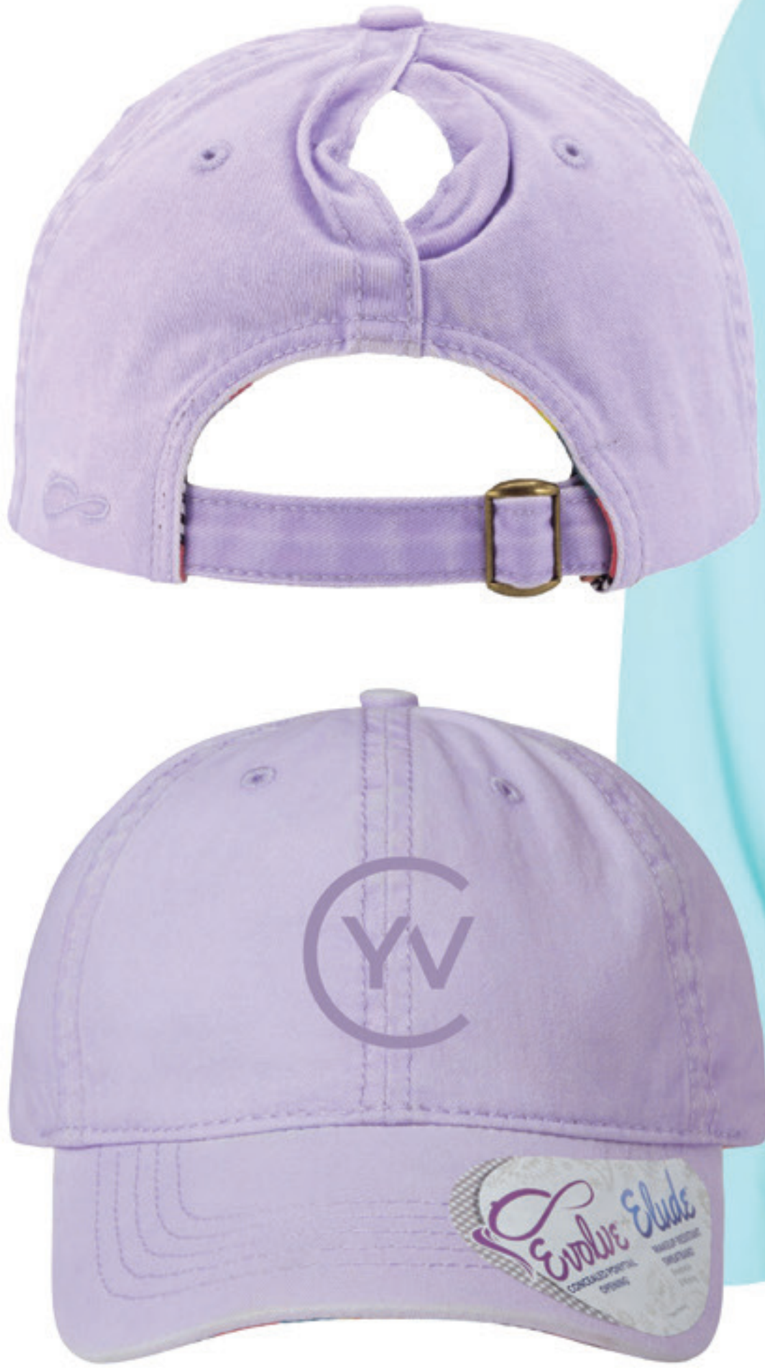
CASSIE Infinity Her Women’s Pigment Dyed Fashion Undervisor Cap