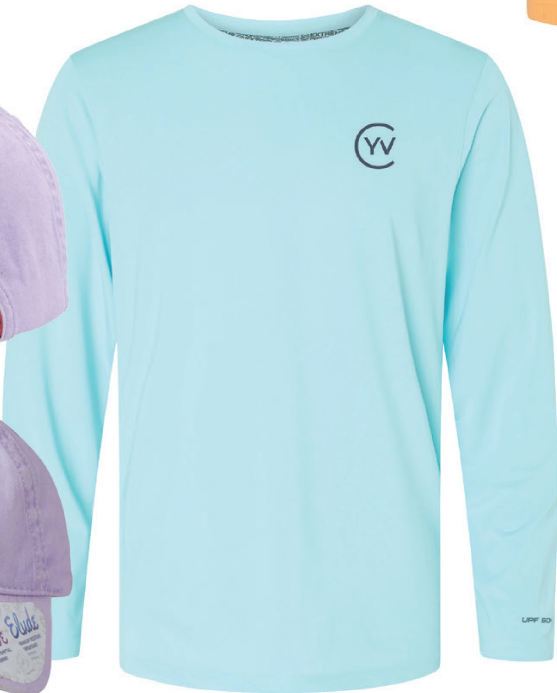
222 Paragon Aruba Extreme Performance Long Sleeve T-Shirt