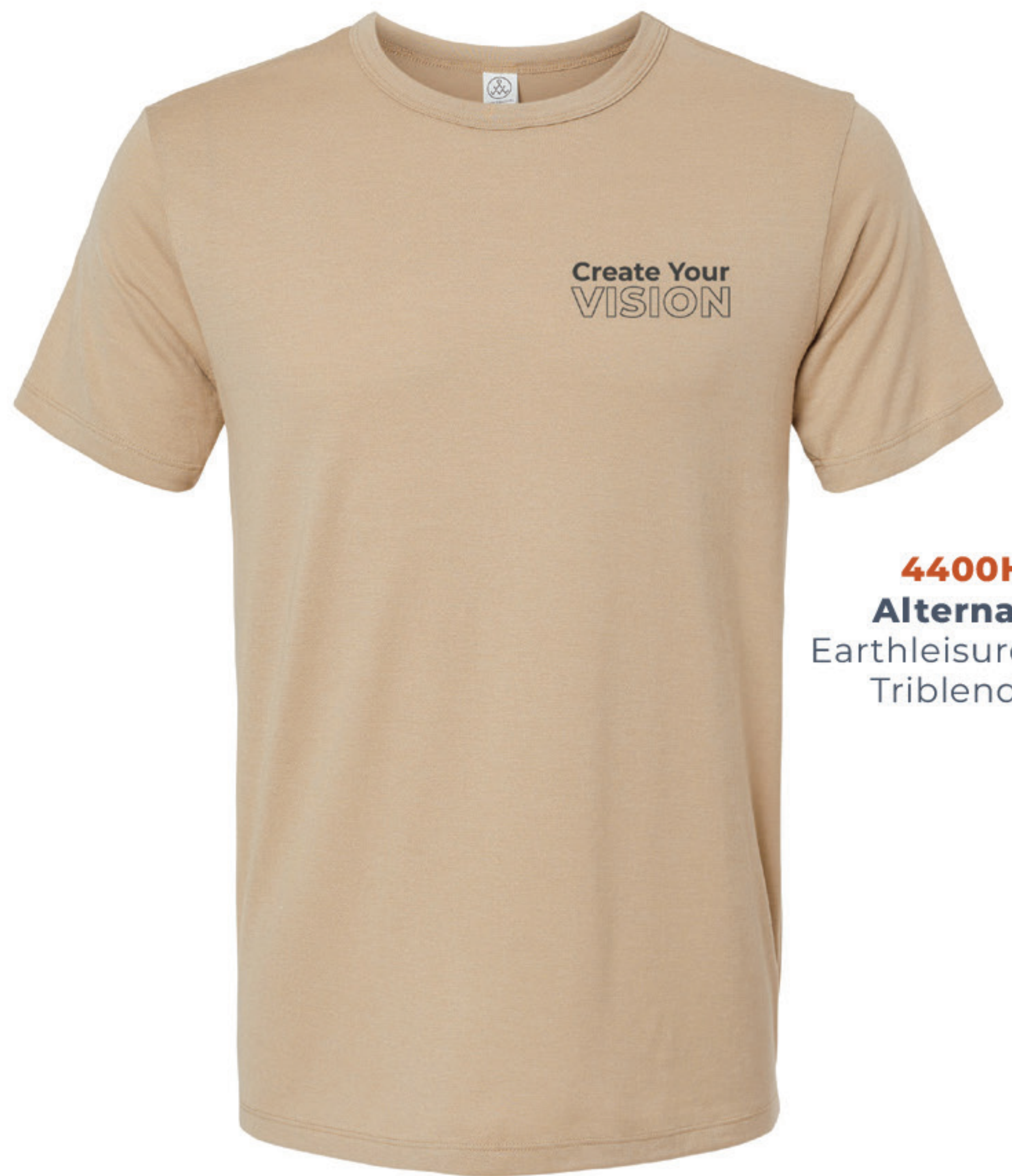
4400HM Alternative Earthleisure Modal Triblend Tee

It's outdoor concert season. Wait, did someone say Summer camp? Corporate retreats are also in full swing. Whether you need music merch, camper gear, or to wow the team - create a lasting connection for this Summer's event lineup.