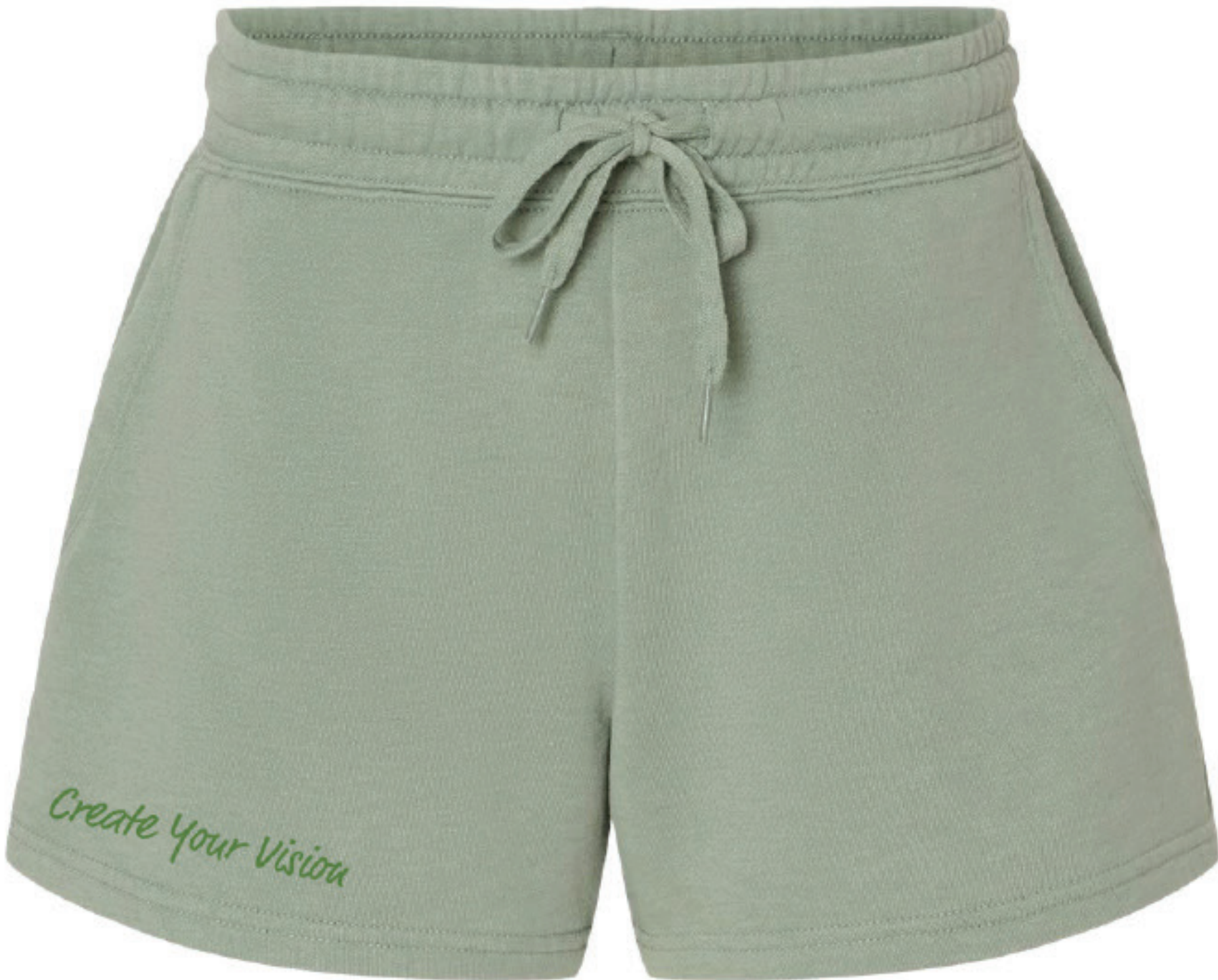
PRM20SRT Independent Trading Co. Women’s Lightweight California Wave Wash Sweatshorts

Branded company swag is a sure fire way to build morale, engage the team, & create internal influencers. When it comes to the company store, think of items the team will feel good wearing time & time again.