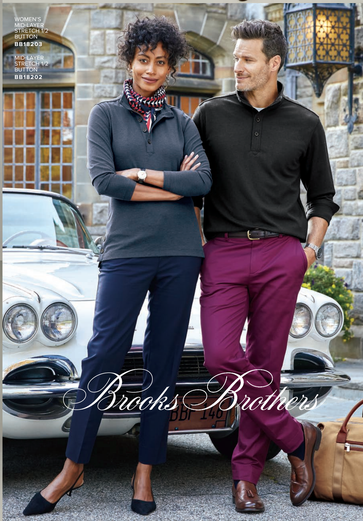
MID-LAYER STRETCH 1/2 BUTTON BB18202