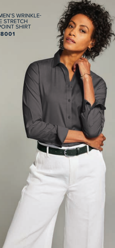
WOMEN'S WRINKLE-FREE STRETCH PINPOINT SHIRT BB18001