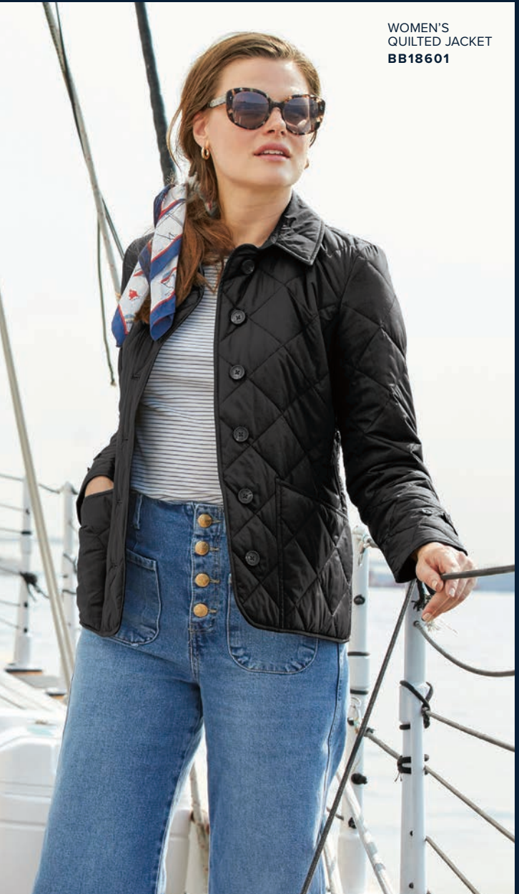
WOMEN'S QUILTED JACKET BB18601

Diamond-quilted outerwear that balances classic American style with contemporary performance.