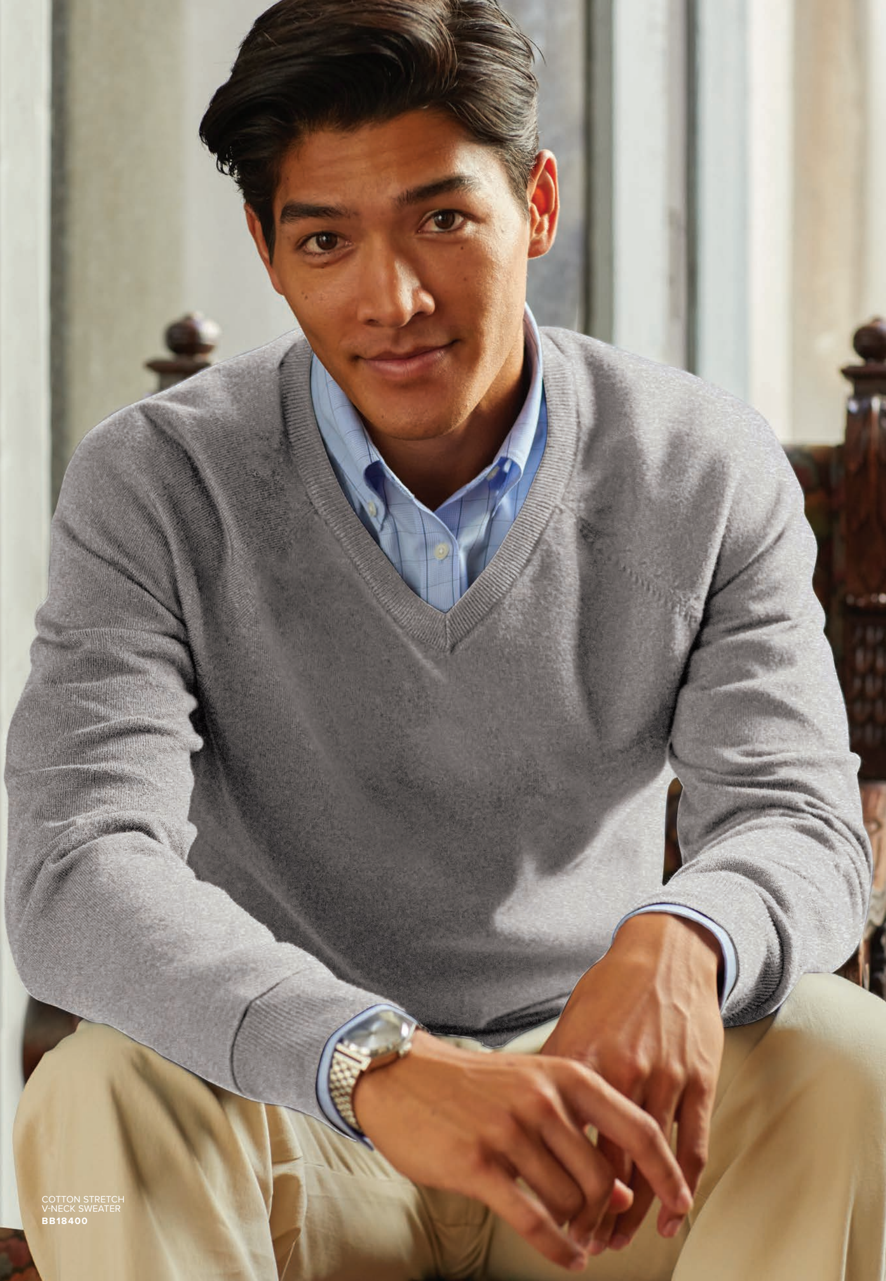
COTTON STRETCH V-NECK SWEATER BB18400