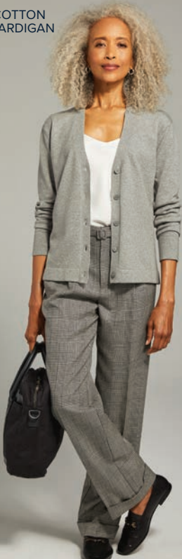
WOMEN'S COTTON STRETCH CARDIGAN SWEATER BB18405