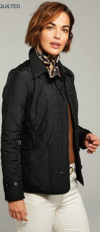
WOMEN'S QUILTED JACKET BB18601