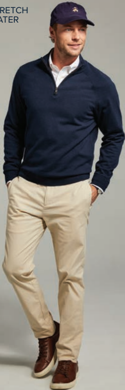
COTTON STRETCH 1/4-ZIP SWEATER BB18402