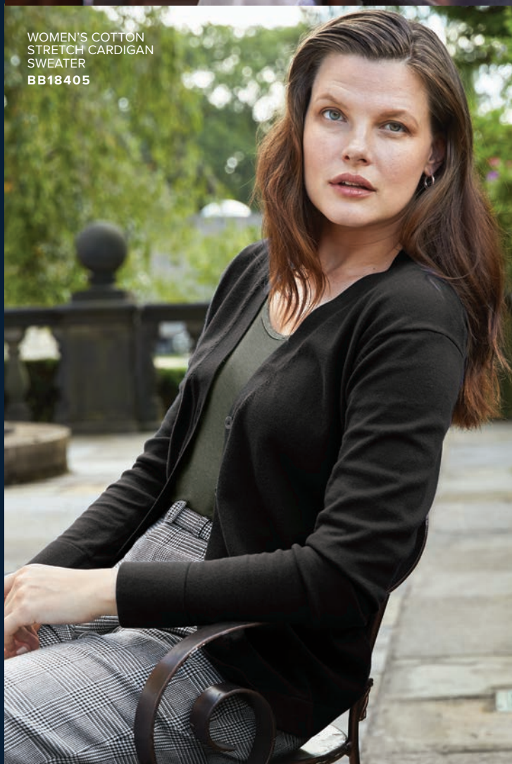
WOMEN'S COTTON STRETCH CARDIGAN SWEATER BB18405