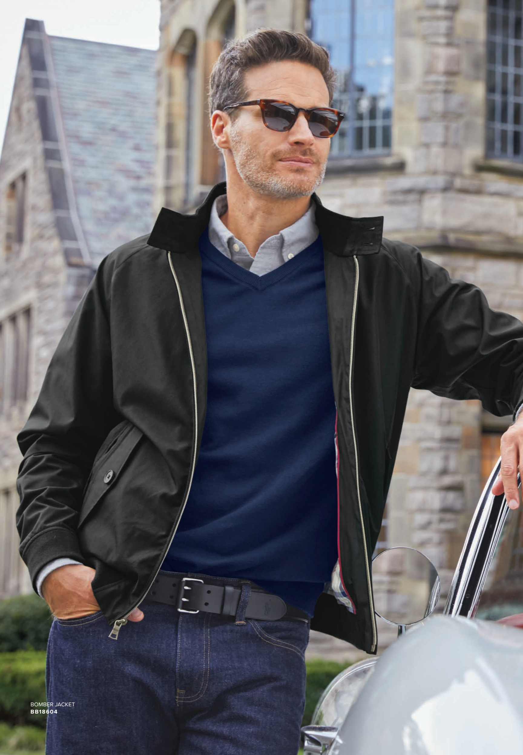
BOMBER JACKET BB18604