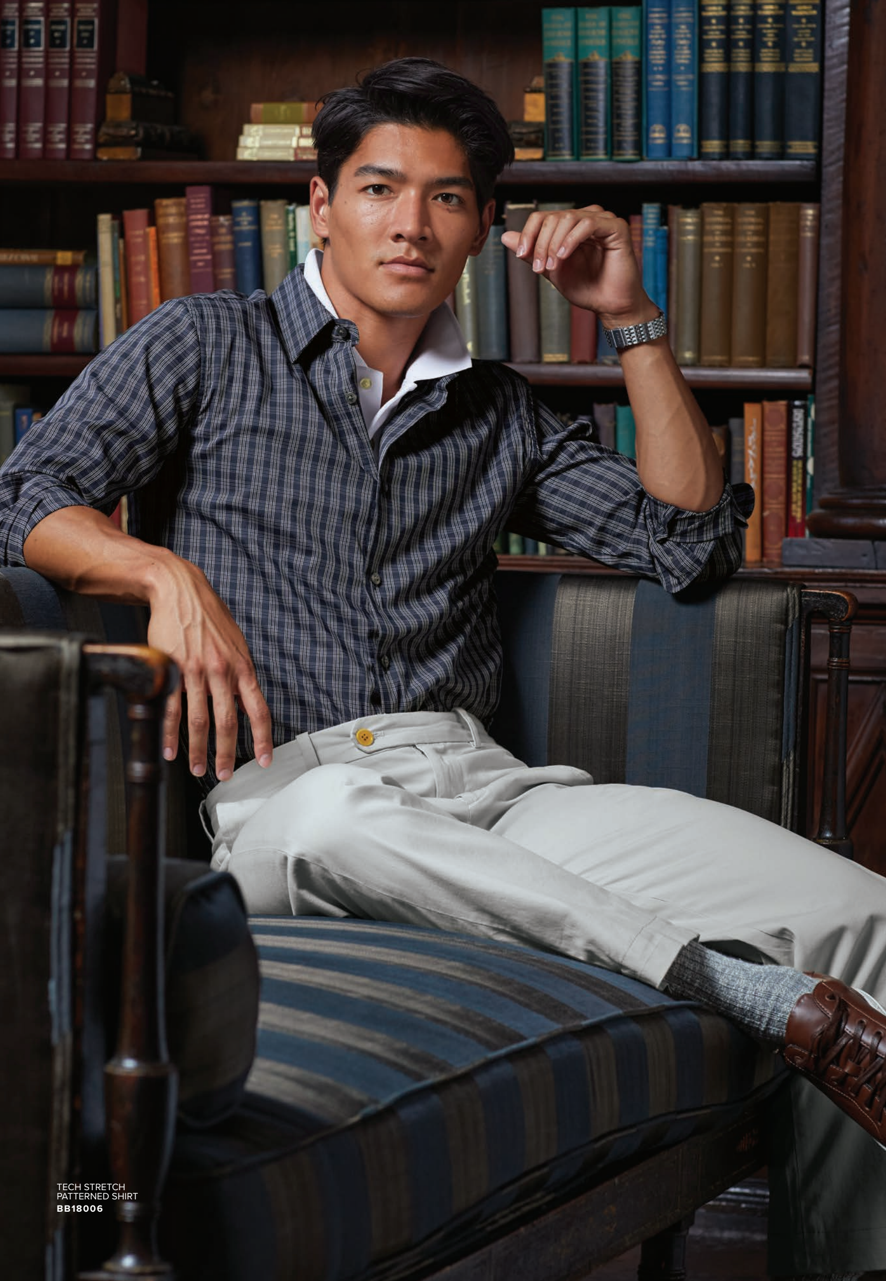
TECH STRETCH PATTERNED SHIRT BB18006