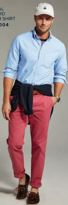
CASUAL OXFORD CLOTH SHIRT BB18004