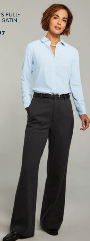
WOMEN'S FULL-BUTTON SATIN BLOUSE BB18007