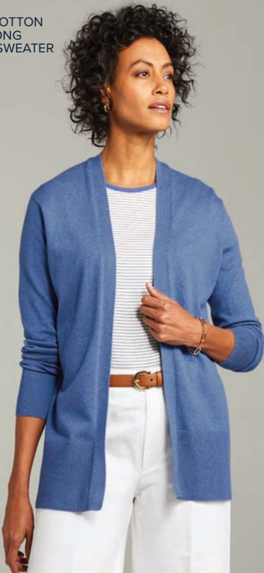
WOMEN'S COTTON STRETCH LONG CARDIGAN SWEATER BB18403