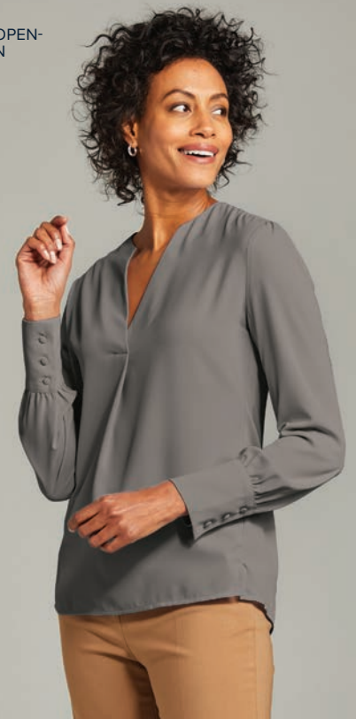
WOMEN'S OPEN- NECK SATIN BLOUSE BB18009