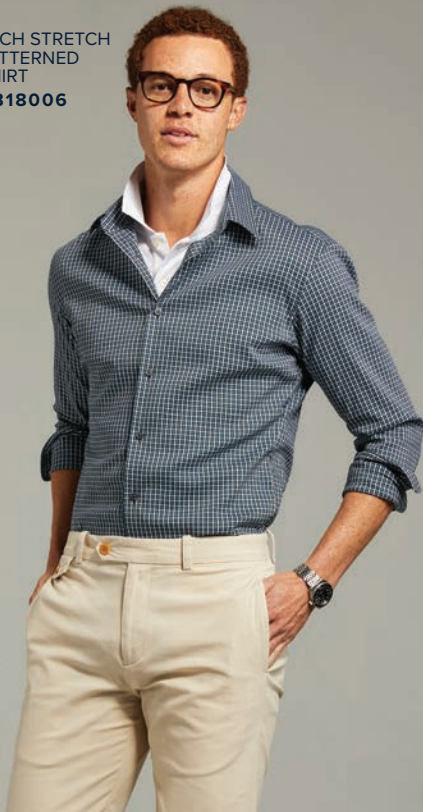
TECH STRETCH PATTERNED SHIRT BB18006