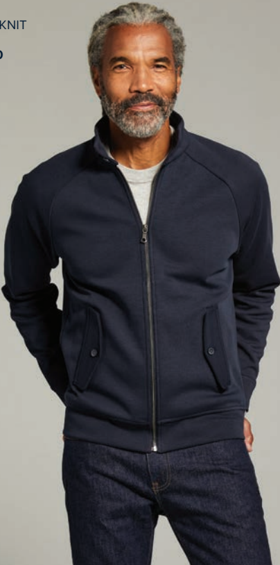
DOUBLE-KNIT FULL ZIP BB18210