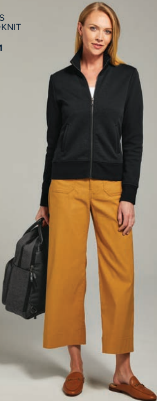
WOMEN'S DOUBLE-KNIT FULL ZIP BB18211