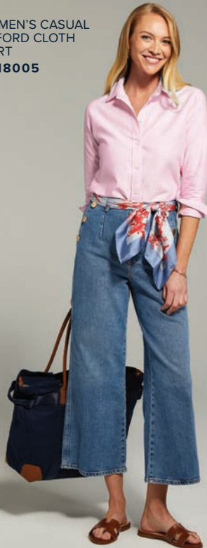
WOMEN'S CASUAL OXFORD CLOTH SHIRT BB18005